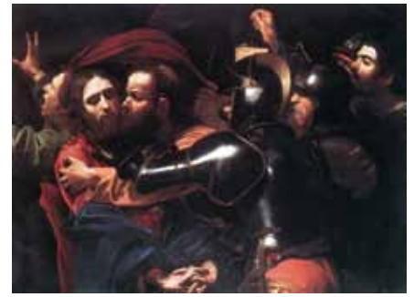
Source Image (above): The Taking of Christ Caravaggio 1602 Oil on canvas 52.6" x 66.7" National Gallery of Ireland, Dublin