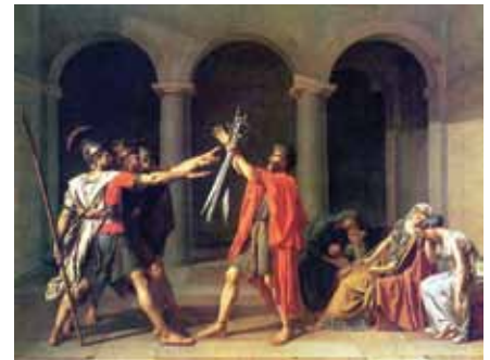
Cover Image (on top): Oath of the Horatii (After David) 2010, oil on linen, 72" x 40"

Additional information can be found at: http://www.joeforkan.com and http://joeforkanblog.com .