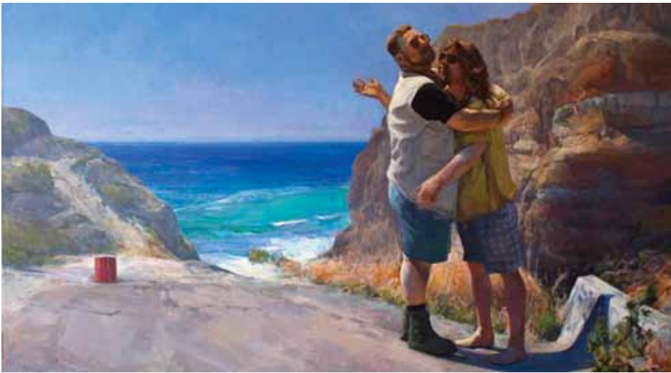
The Lamentation (After Rubens) , 2011, oil on linen, 72" x 40"