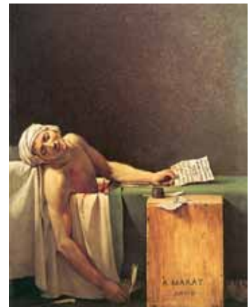
(on left): The Death of Marat (After David) 2008, oil on linen, 96" x 58"