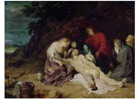
Source Image (above): The Lamentation Peter Paul Rubens 1614 Oil on wood 16" x 20.86" Kunsthistorisches Museum, Vienna