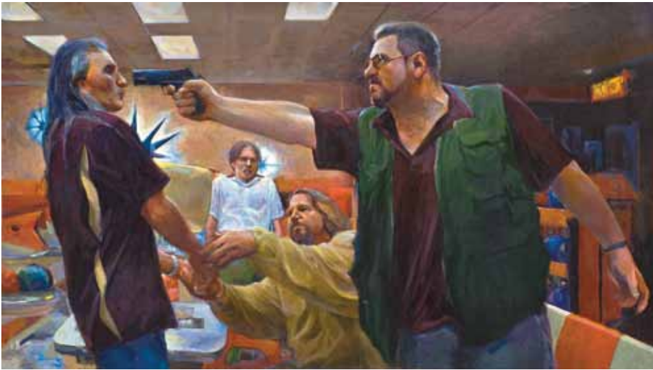
The Taking of Christ (After Caravaggio) , 2009, oil on linen, 72" x 40"